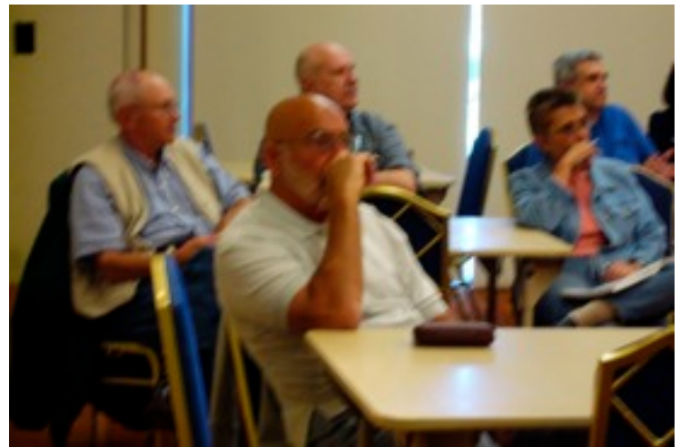
Mac Users at the March 17 meeting are show above.